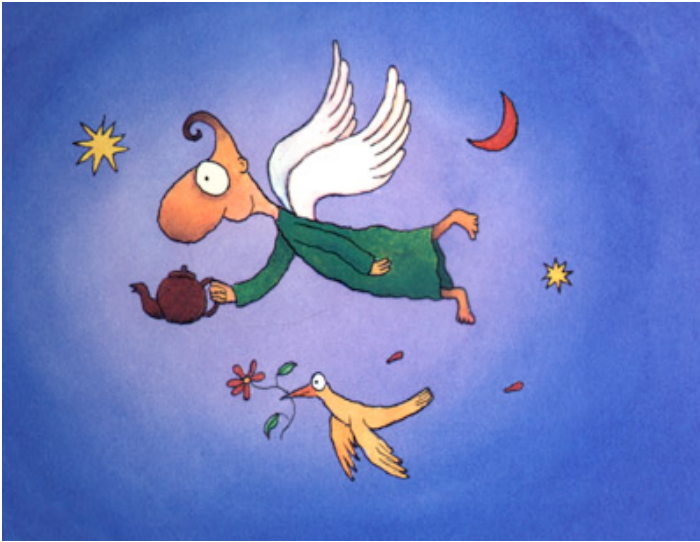
Mr Curly loves teapots too

Life is full of choice. The fact is, even when I'm feeling frantic and overwhelmed I still have choices, no matter how 'out of control' my situation may feel. Slow time is essential to my every day wellbeing, but slow time is always a choice. Choosing to do certain things slowly has a cost, for doing things slowly is slow.